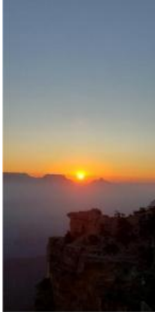
Eternity, Arizona 2019 8x11