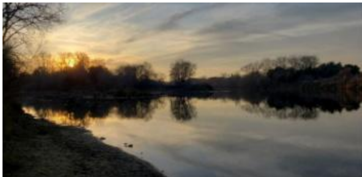
Palau Pacific Resort, 1996 11x6