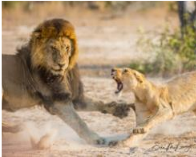
The Hoof , Sabi Sand, South Africa 2019 11x14