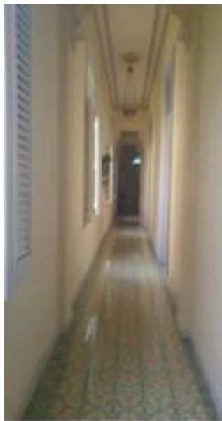
Echoes, Havana, Cuba 2018 5x7